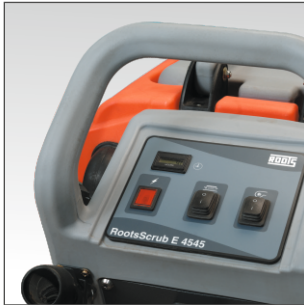
Ergonomic handle for operators of any height. Excellent view of the area to be cleaned.