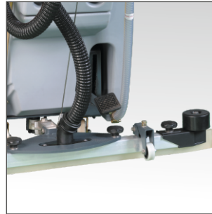
The straight, floating squeegee makes working close to edges possible and ensures that no water streaks remain even when negotiating corners.