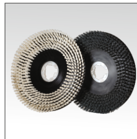
Variety of brushes to suit different applications.