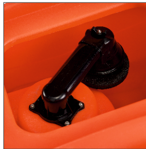
Easy tank cleaning, thanks to the large tank opening. Tank can be emptied quickly and easily via the large outlet hose. Overflow protection for the dirty water tank.