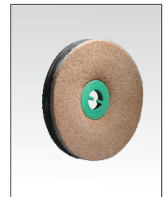
Pad holder available as option